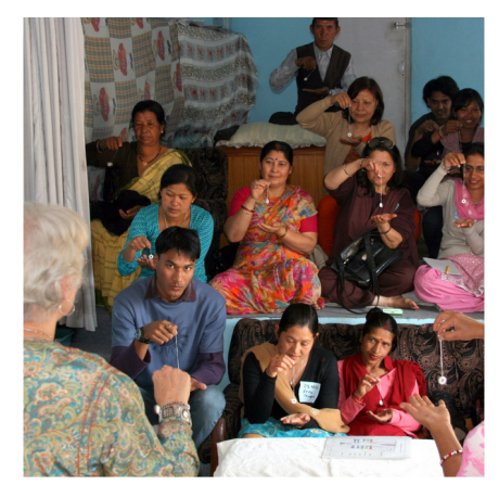
2010- Teaching a Level I class in Nepal.