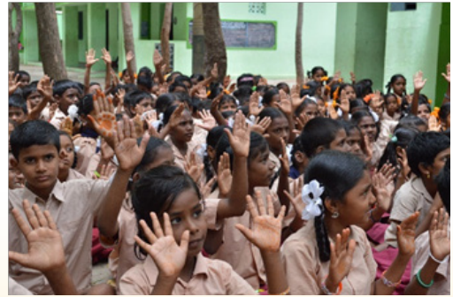
Our Hands have super powers when we bring love to them